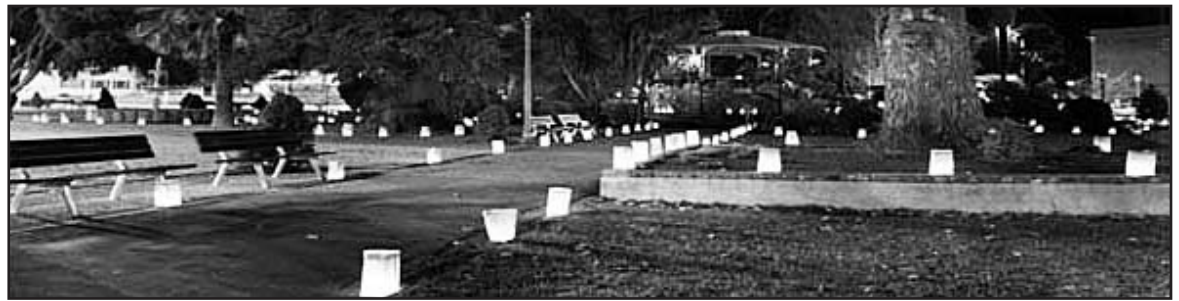
Candleria light the Watsonville Plaza.