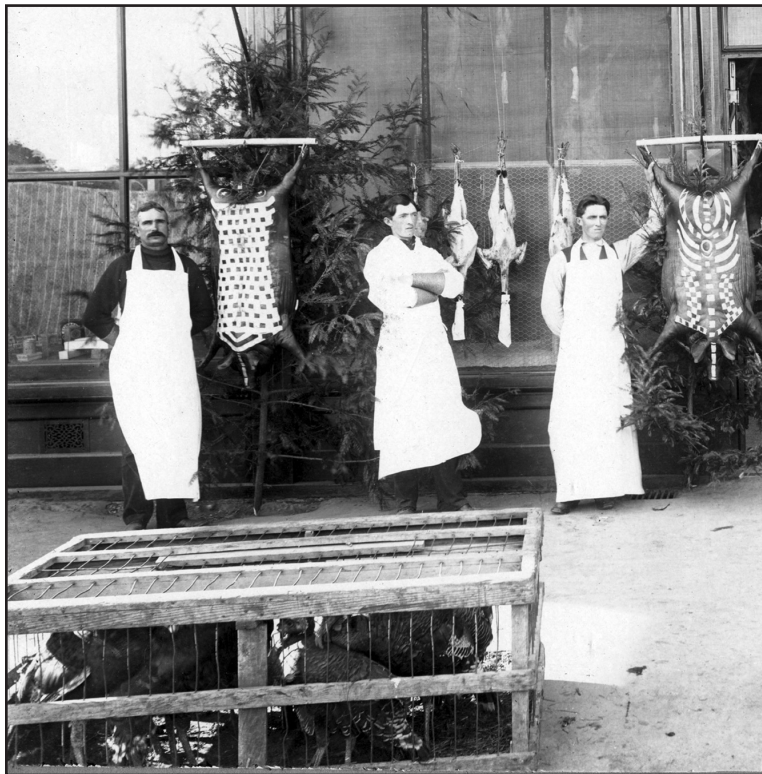
Quinn's Meat Shop on Main Street displays its holiday selection of product in this photo taken around 1910. Of note is the practice of Blood Art, which can be seen on the carcasses of the animals for sale. Dressed turkeys hang in the background and a crate of live turkeys sits in front. Refridgeration, as we know it for the home, was not developed by General Electric until 1927, so fresh kill was the best method for meat delivery.