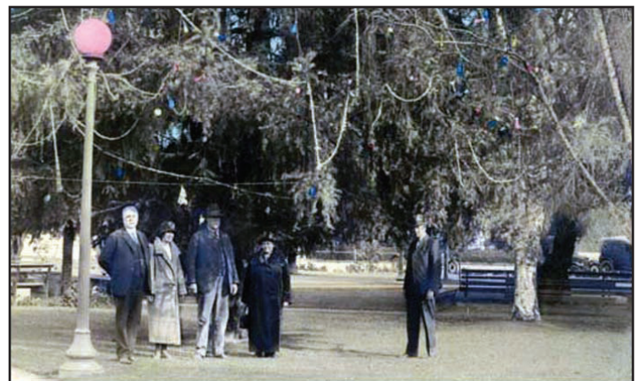
Chamber of Commerce members pose under lights that have been strung on Watsonville City Plaza. (circa 1934)