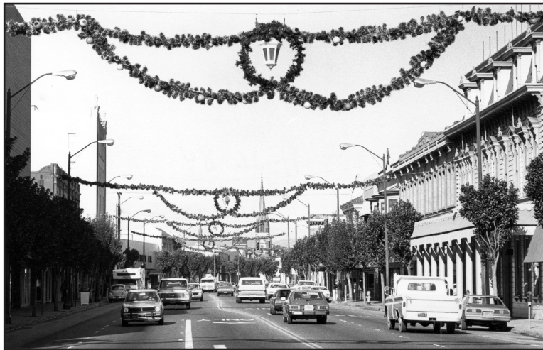
Main Street is decorated for the holidays. (circa 1980)