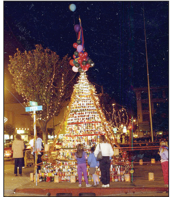
The "Canned Food" Christmas tree at Peck and Main streets shows the clever way the community has solicited donations.