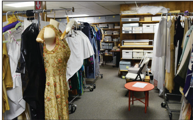
Inside the Bernice Porter Annex.