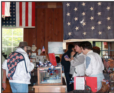
Guests look at the flag display.