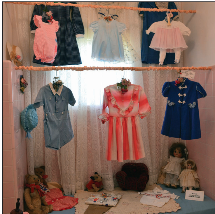
A display of children's clothes.

Freedom called Schmidt's. We just opened a box and found it. That's part of the thrill."